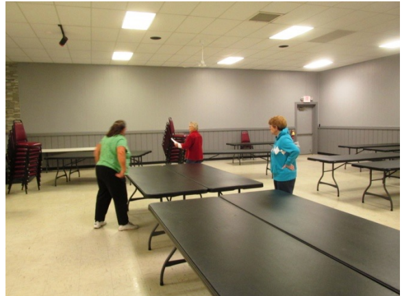
(Placing the tables for displays and vendor's)